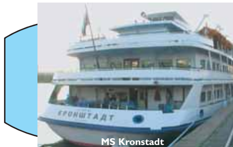
Lower Deck (Deck I)